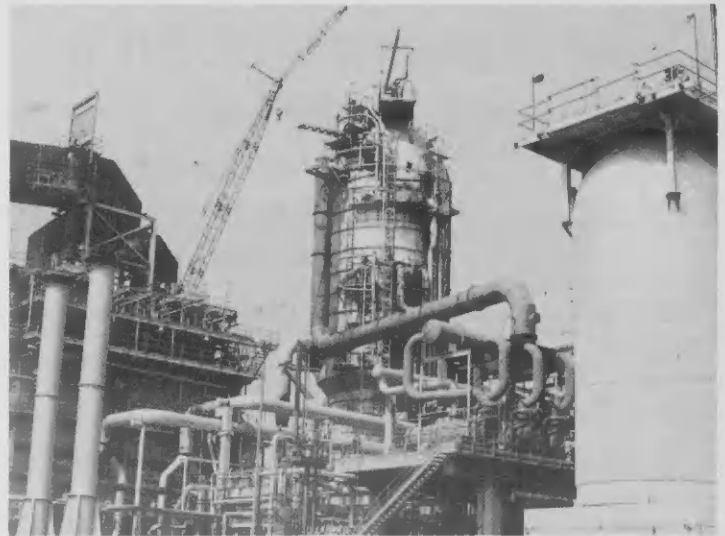
Two refinery units are undergoing major turnarounds. Above: the vacuum tower during the V3AR turnaround activities. Below: employees are inspecting the new pigtails at the H3AR unit.